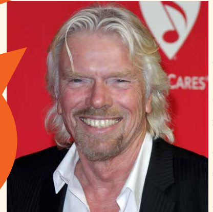
Richard Branson, Entrepreneur